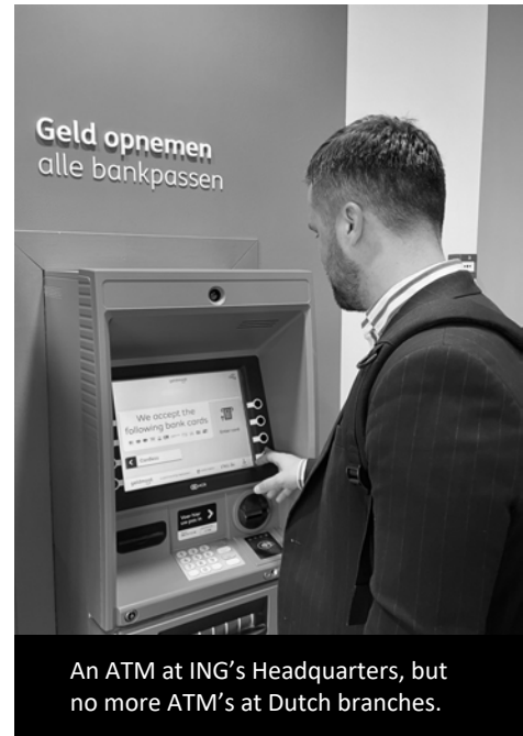
An ATM at ING's Headquarters, but no more ATM's at Dutch branches.

ING, in response to the digital shift in customer behaviour, removed all ATMs from its branches in October 2021, effectively going "cashless." maib's team had the opportunity to witness and understand the rationale behind this transformative decision, gathering insights on how ING executed the cashless transition.