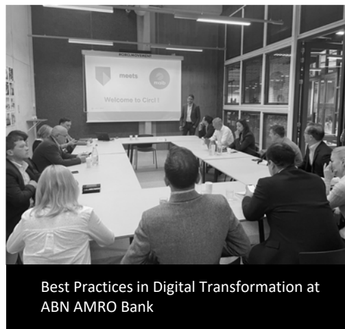
Best Practices in Digital Transformation at ABN AMRO Bank