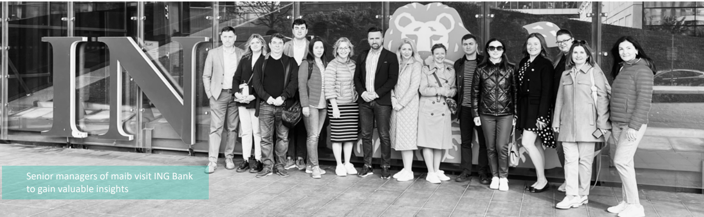
Senior managers of maib visit ING Bank to gain valuable insights

They embarked on a three-day immersive experience to gather fresh ideas and insights for their leadership team, organised by Wisselbanck. The overarching goal was to develop a strategy which will propel maib to become the leading bank in Moldova and the wider region.