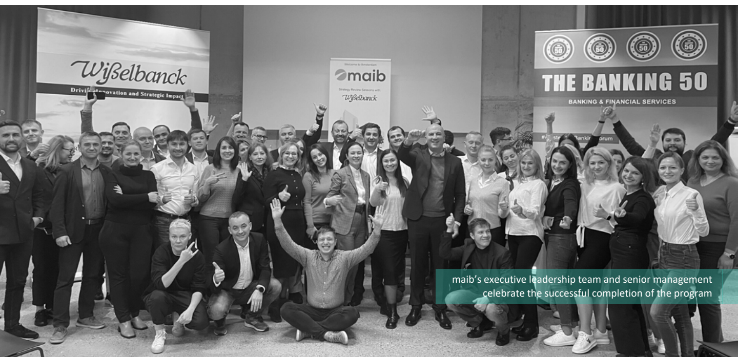
maib's executive leadership team and senior management celebrate the successful completion of the program